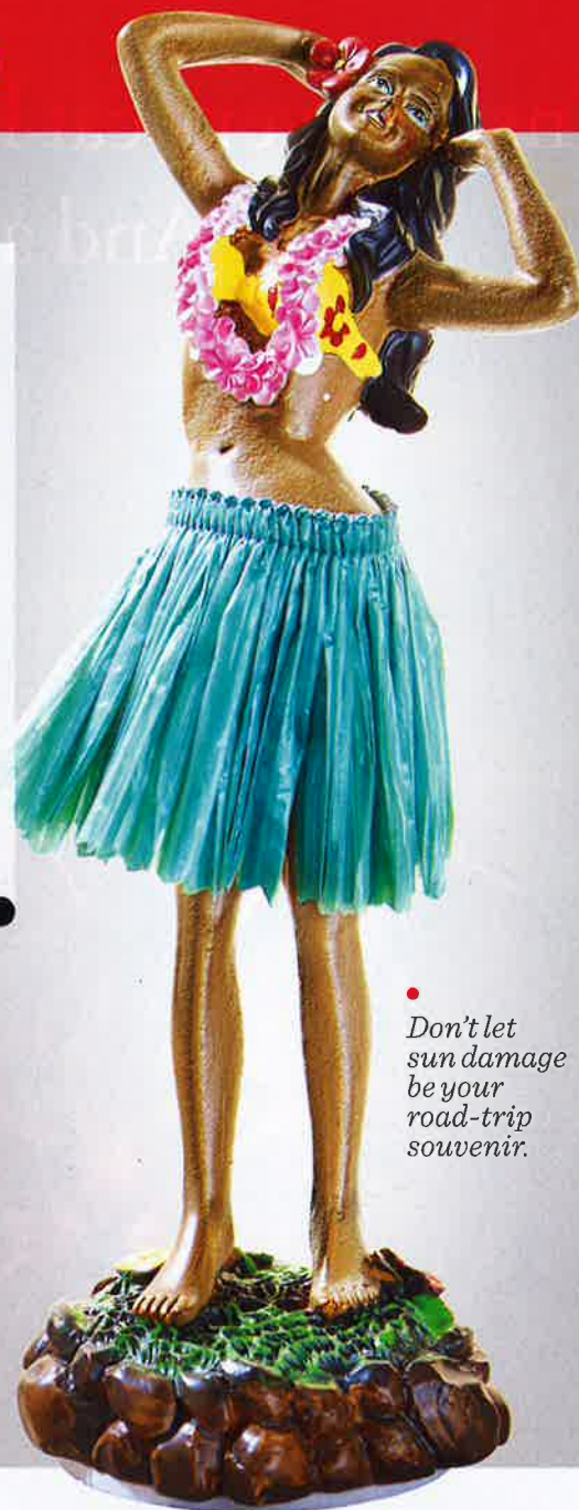
• Don't let sun damage be your road-trip souvenir.

So this is shady: While the average car windshield has an SPF of about 50, most side windows clock in at just around SPF 16, according to Debra Levy, president of the Auto Glass Safety Council. No wonder that the majority of all skin cancer cases occur on the left side of the body. As always, SPF 30 is a must (use an extra layer on your left if you're driving; right, if you're shotgun) , says Steven Wang, M.D., director of dermatologic surgery at Memorial Sloan-Kettering Cancer Center in Basking Ridge, New Jersey. For more protection, consider UV-blocking film. Llumar shields you from 99 percent of UVA and UVB rays, carries the Skin Cancer Foundation Seal of Recommendation, and comes in clear or tinted (prices range from $200 to $500; find a dealer at Llumar.com).